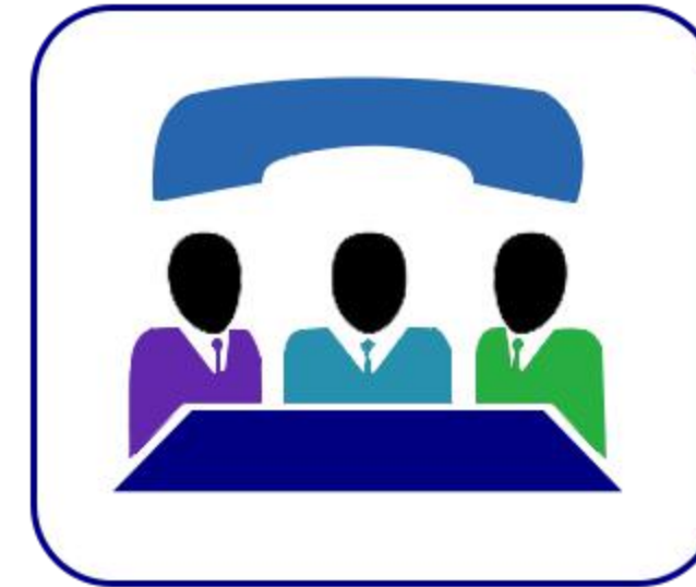
Tele Conference Bridge