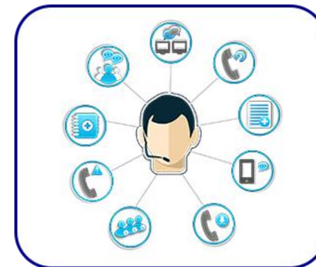
Party worker to Voter calling system