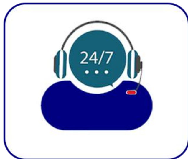
Help Line/ Feedback Call Center