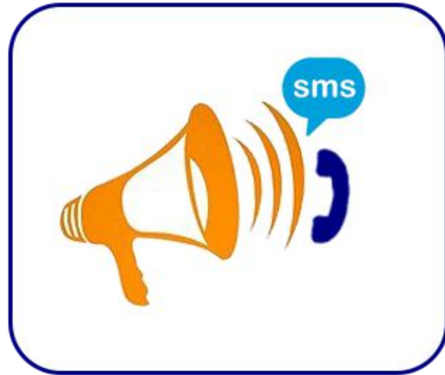
Voice and SMS Broadcast